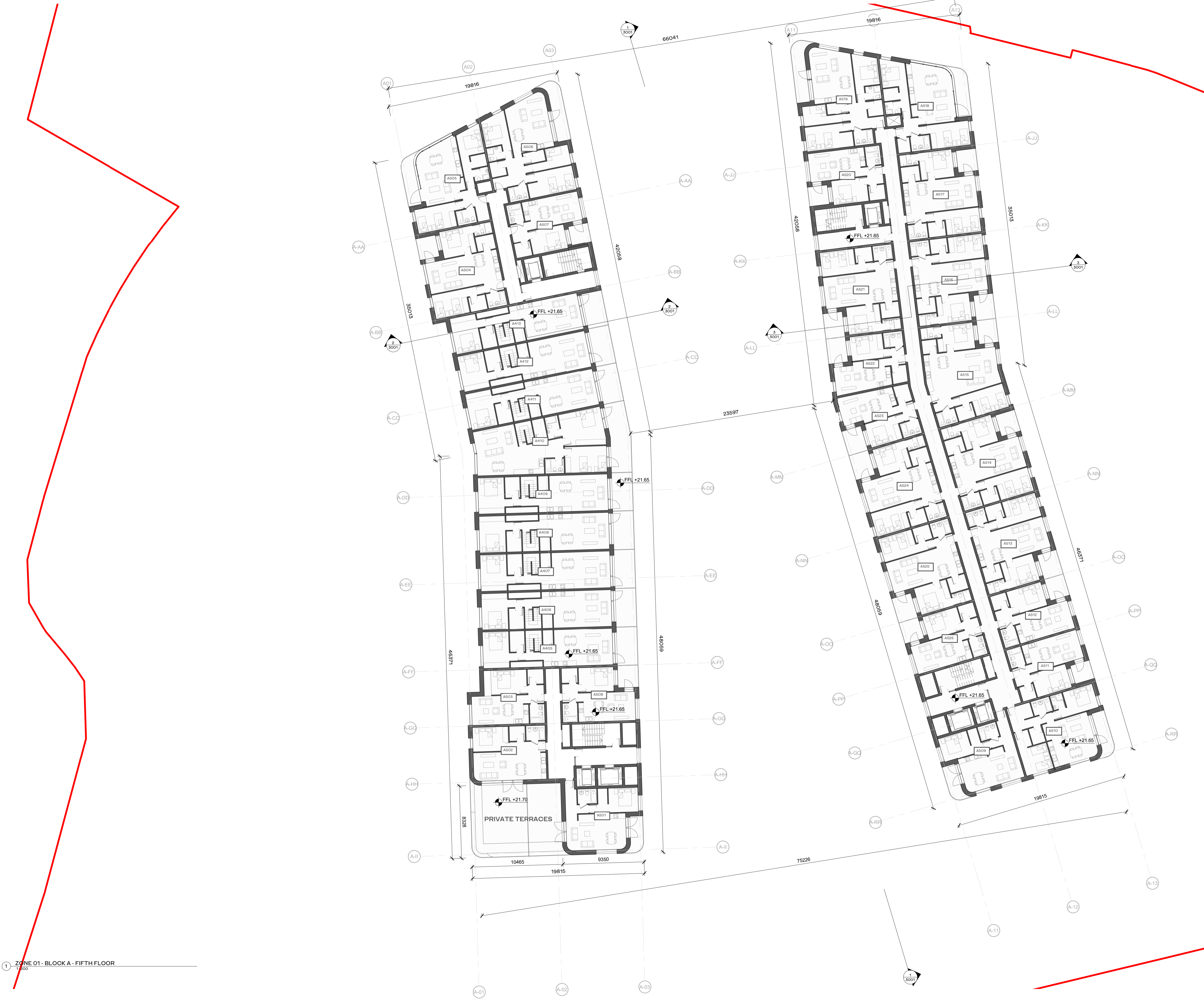
1 ZONE 01 - BLOCK A - FIFTH FLOOR 11/2019

Henry J Lyons Architecture + Interiors +353 1 898 3333 info@henryjlyons.com 53-54 Pearse Street Dublin D02 K466